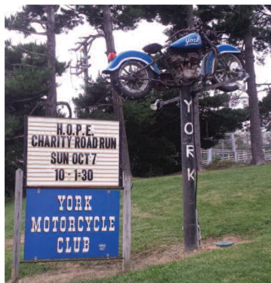
Our sign actually caught the attention of some riders who stopped in and registered!