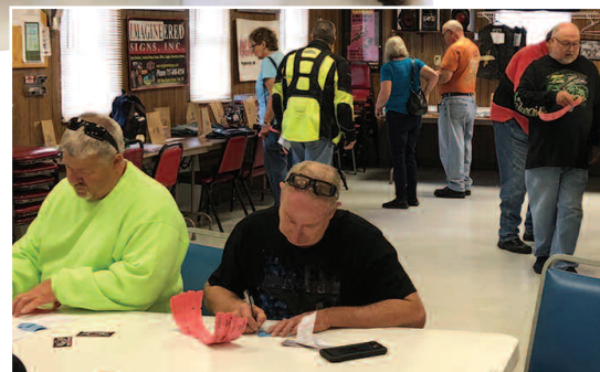
Lots of good donated stuff to raffle and auction.