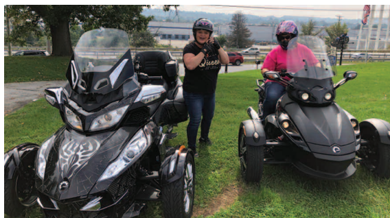
A group of Infamous Ryders rolled in to support the cause – and 2 of the ladies were on Spyders. It was great meeting them all.